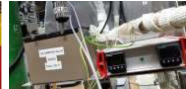
6-way valve and hot box design