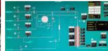
Full SCADA control